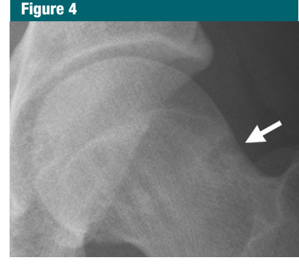
Figure 4: AP view shows FCC (arrow). FCC in the epiphyseal vicinity may develop secondary to the impingement process and is seen as a small area of cystic radiolucency surrounded by a thinner sclerotic margin.

Of 2081 subjects who accepted the invitation to participate in this study, 2060 were included for further analysis; of 2060, 868 (42.1%) were male participants and 1192 (57.9%) were female participants. Twenty-one of 2081 subjects were excluded because of sub-