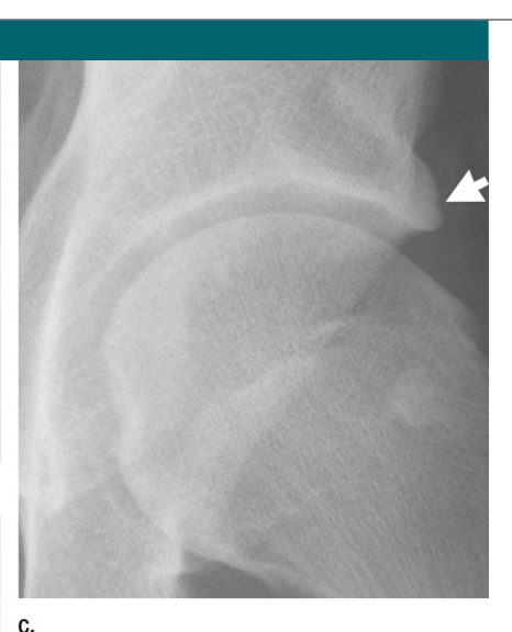
Figure 3: AP views show pincer-type findings. (a) Crossover sign (COS) (arrow). This sign is positive when the anterior wall of the acetabulum crosses the posterior border of the acetabulum medial to the lateral rim of the weight-bearing sourcil area. (b) Posterior wall sign (arrow). This sign is positive when the posterior wall lies medial to the center of the femoral head. (c) Excessive acetabular coverage (arrow). This finding is seen as an extension of the lateral acetabular rim in the inferior and/or lateral direction.