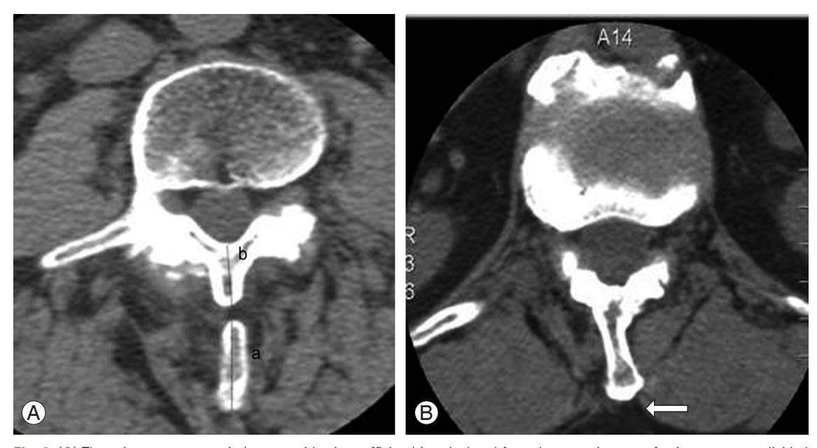
Fig. 2. (A) The spinous process ratio (osteotomi-basis coefficient) is calculated from the posterior part of spinous process divided on the basis and the anterior part of the remaining spinous process (a/b). This computed tomography (CT)-scan picture show a spinous process that is not united. (B) This picture show a CT-scan with a united spinous process. The arrow indicates were the osteotomy were performed.

3) To assess the union of the spinous process osteotomy, computed tomography (CT)-scans with 3 mm slices and spacing of the operated level were done (GE High-Speed 98). An experienced neuroradiologist performed the radiological evaluation. Full continuity of the spinous process was classified as "union," whereas discontinuity was classified as "non-union." The patients were divided